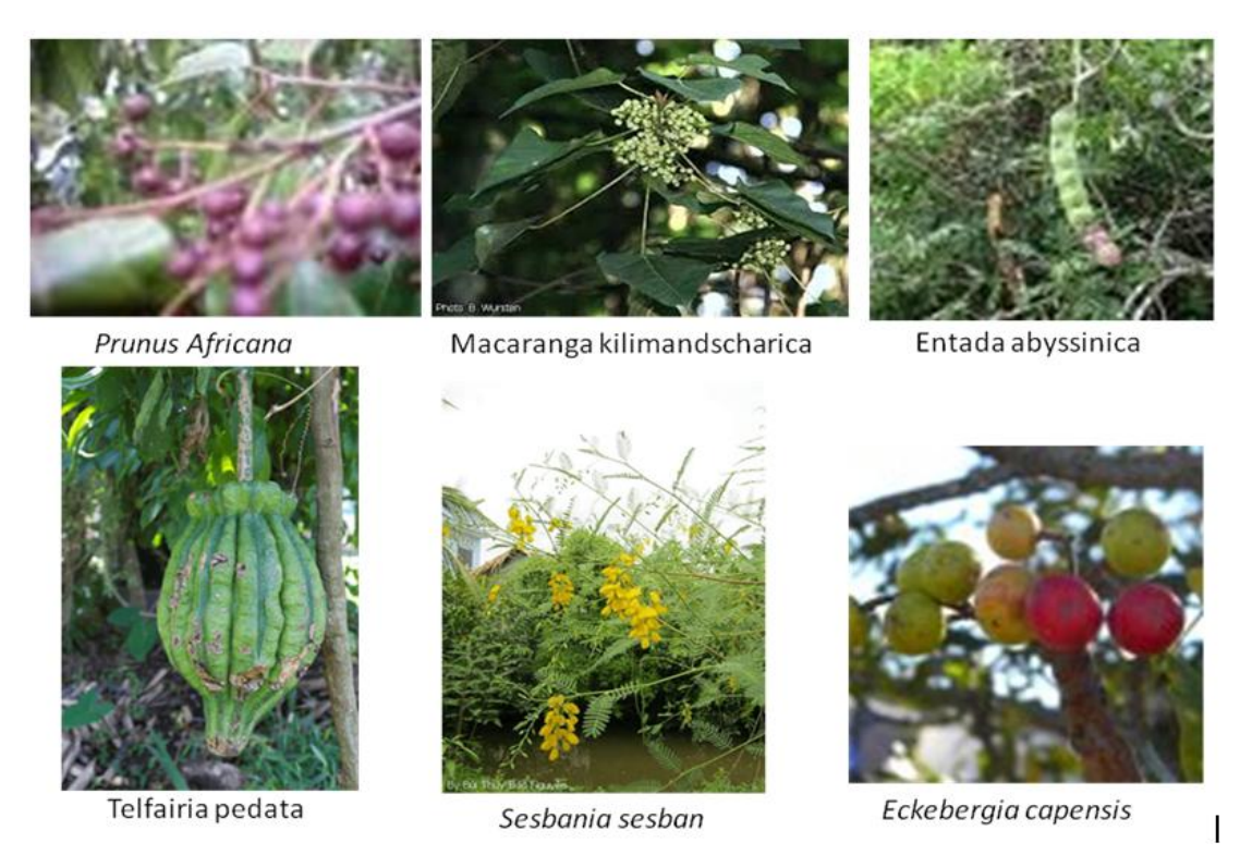
Fig. 1. Photography of the six studied plants

The fatty acid composition was determined following the ISO standard ISO 5509:2000 [21]. In brief, one drop of the oil was dissolved in 1 mL of n-heptane; 50 µg of sodium methylate was added, and the closed tube was agitated vigorously for 1 min at room temperature.